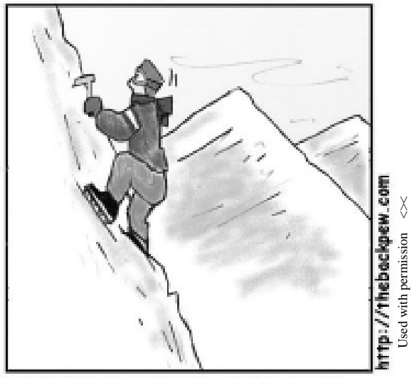
THE PURSUIT OF 600, MAKE SURE YOU ARE ON THE RIGHT NOUNTAIN, I RELEVE SINCERELY CLIMBING THE WRONG NOUNTAIN WILL BE A TRACK INSTAKE THE DE ID OFFLU OFF. OOD, OFF. MOULTO, HE OWER

THERE IS OILY ONE GOD, ONE WAY TO HEAVEN.